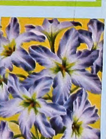
GLORY OF THE SUN (Leucocoryne Ixiodes)

NO. 5875 10 BULBS ONLY $1.25 20 BULBS ONLY $2.25